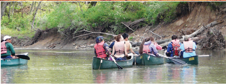
High schoolers observe fluvial processes and study glacial materials and bedrock in their canoe trip in the Middle Fork of the Vermillion River