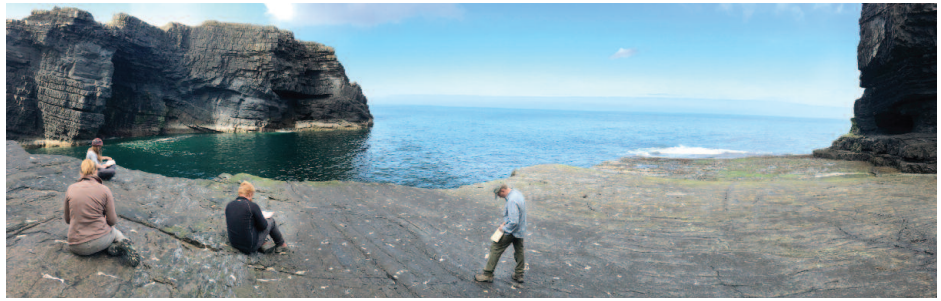
Logging and examining sediments of an ancient submarine fan, near Ross, County Clare

The field class included group field and evening seminars from all participants, in teams that fostered collaboration