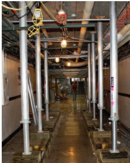
Steel beams support the sagging floors of the Natural History Building