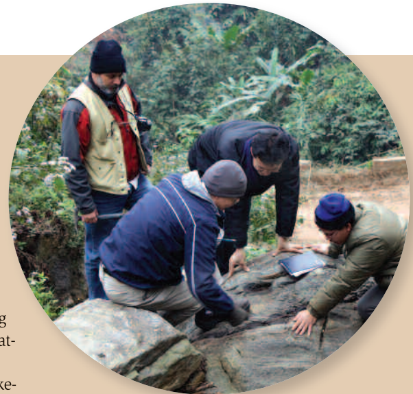
Faculty members study rock formations in Vietnam