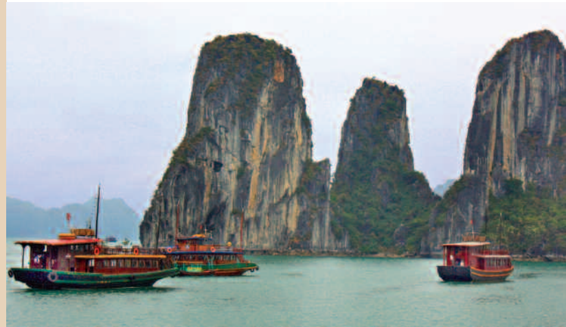
Karst topography at Halong Bay, Vietnam

National University System, HUS is in the process of collaborating with various US institutions to revise their curriculum. Attracted to the international reputation of UIUC in general and that of the Department in particular, officials from the HUS plan to model their